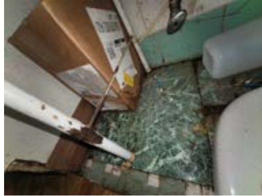
2509-8 12"x12" Floor Tile/Adhesive Interior Bathroom