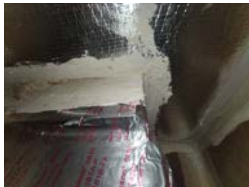
2509-6 Duct Mastic Typical Interior HVAC