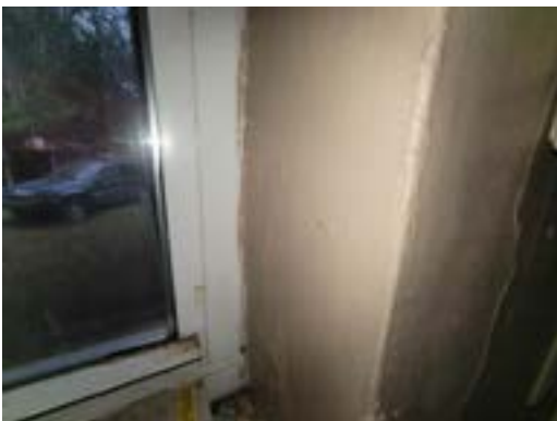
2509-5 Caulk Typical Interior Windows