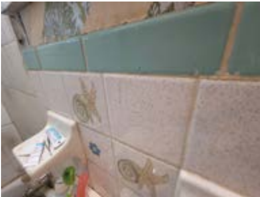
2509-9 Grout Interior Bathroom Ceramic Wall Tile