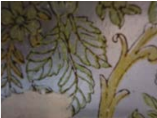
2509-11 Wallpaper/Adhesive Typical Interior Walls