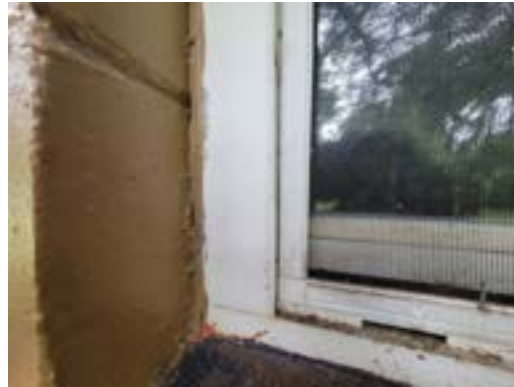
2509-2 Caulk Typical Exterior Windows