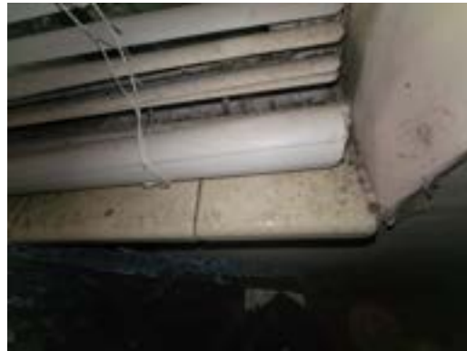
2509-10 Grout Typical Interior Window Sills