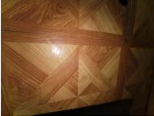
2509-7 12"x12" Floor Tile/Adhesive Interior Bathroom