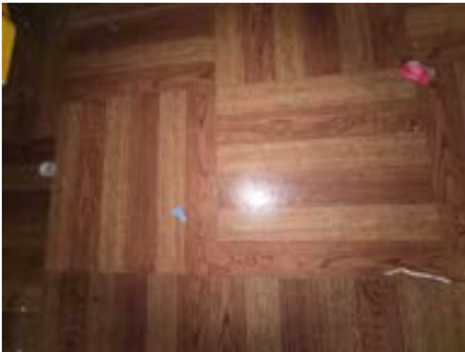
2509-3 12"x12" Floor Tile Interior Kitchen