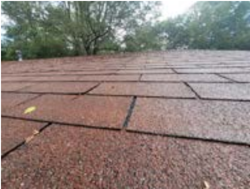
2509-1 Asphalt Shingle/Tar Typical Exterior Roof